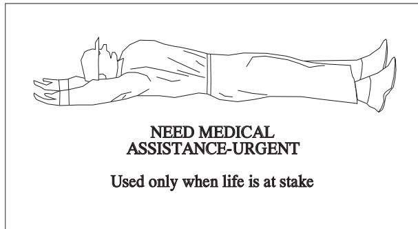
FIG 6-2-3 Urgent Medical Assistance